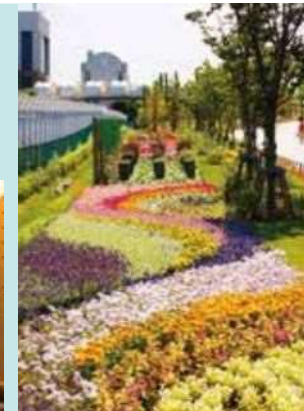
Flowerbeds showcasing the colors of summer.

Dream Plaza is a 6,000 m 2 lawn stretching from Tokyo Teleport Station to Dream Bridge. (It's also a bustling new space in the Waterfront Subcenter!)