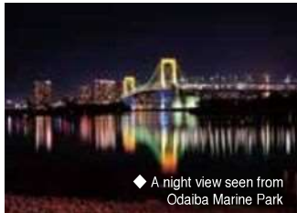
◆ A night view seen from Odaiba Marine Park