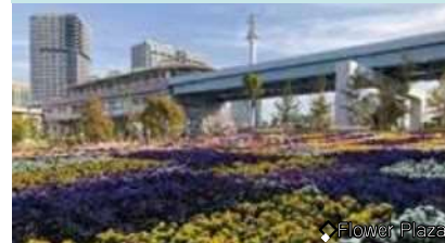
◆ Flower Plaza

A north-south promenade connecting Tokyo Big Sight and Ariake Tennis Park. The Stone and Light Square at its center is also registered as a venue for the Heaven Artist project.