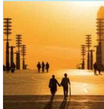
Sunset in Tokyo Waterfront City seen from Yume-no-Ohashi Bridge.

An east-west promenade connecting the Central Plaza and Stone and Light Square. Tokyo Teleport Station Plaza is registered as a venue for the Heaven Artist project.