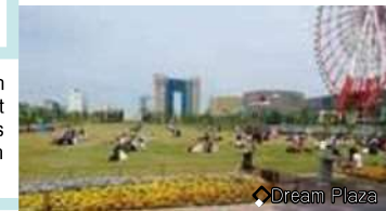
◆ Dream Plaza

New Transit Yurikamome: Get off at any station between Odaiba-kaihinkoen and Ariake Rinkai Line: Get off at Tokyo Teleport or Kokusai-Tenjijo Water bus: Get on at Hinode Pier (8 min. walk from JR Hamamatsu Station) and get off at Tokyo Big Sight