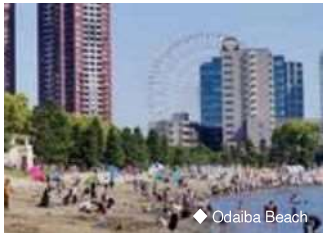
◆ Odaiba Beach