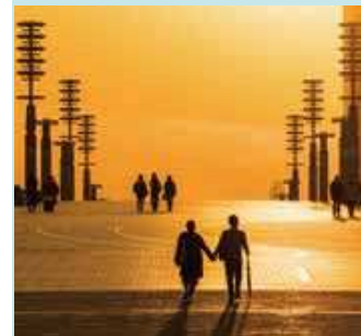
Sunset in Tokyo Waterfront City seen from Yume-no-Ohashi Bridge.

An east-west promenade connecting the Central Plaza and Stone and Light Square. Tokyo Teletop Station Plaza is registered as a venue for the Heaven Artist project.