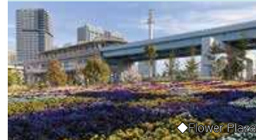
◆ Flower Plaza

A north-south promenade connecting Tokyo Big Sight and Ariake Tennis Park. The Stone and Light Square at its center is also registered as a venue for the Heaven Artist project.