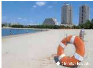
◆ Odaiba Beach