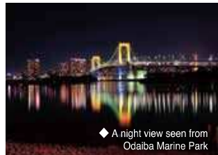
◆ A night view seen from Odaiba Marine Park