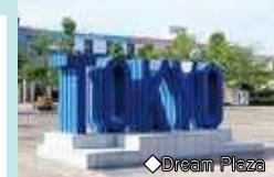
◆ Dream Plaza

A monument featuring the letters "TOKYO" stands in front of Tokyo Teletop Station to commemorate the holding of the Tokyo 2020 Games in the waterfront area.