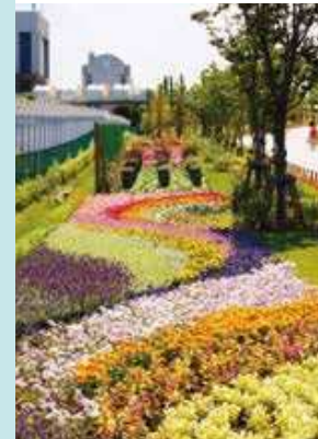
Flowerbeds showcasing the colors of summer.

New Transit Yurikamome: Get off at any station between Odaiba-kaihinkoen and Ariake Rinkai Line: Get off at Tokyo Teletop or Kokusai-Tenjijo Water bus: Get on at Hinode Pier (8 min. walk from JR Hamamatsu Station) and get off at Tokyo Big Sight