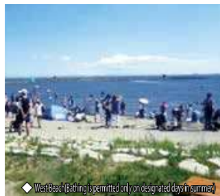
◆ West Beach (Bathing is permitted only on designated days in summer)

In October 2018, Kasai Marine park was recognized as a wetland of international importance and became Tokyo's first Ramsar Site. This park is a valuable example of the conservation of a vast natural wetland in a megacity, with human activities and rich nature coexisting in harmony.