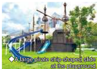
◆A large pirate ship-shaped slide at the playground