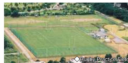
◆Rugby Practice Field