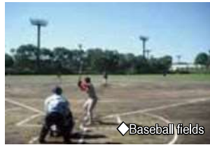
◆ Baseball fields

A park equipped with a wide variety of sports facilities. On certain days the class 3 certified track and field facilities are available for use by the general public.