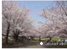
◆ Sakura Field