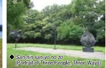
◆ San-nin san-yo no zo [Portrait of Three People, Three Ways]