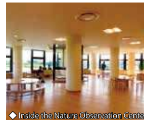
◆ Inside the Nature Observation Center