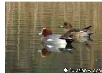
◆ Eurasian wigeon