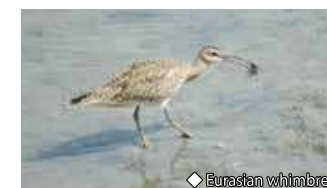
◆ Eurasian whimbrel

Monorail: Get off at Ryutsu Center/15 min. walk Keikyuu Bus: Get on the Mori 24, 32, 36, 43, 45, 47 or bus at the East Exit of JR Omori Station or Keikyuu Heiwajima Station and get off at Tokyo Port Wild Bird Park or Wild Bird Park.