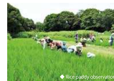
◆ Rice paddy observation

The East Asian-Australasian Flyway Partnership is an international project in which countries and NGOs from regions where the waterfowl of Japan and other nations migrate such as the U.S., Russia, China, South Korea, Southeast Asia, and Australia work together to promote the preservation of waterfowl and the wetlands which are their habitat. Tokyo Port Wild Bird Park, together with other areas such as Yatsu-higata, Osaka Nankou Bird Sanctuary, and the mouth of the Kuma River in Kumamoto Prefecture, participates in this partnership as an important habitat for sandpipers and plovers.