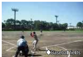
◆ Baseball fields

A park equipped with a wide variety of sports facilities. On certain days the class 3 certified track and field facilities are available for use by the general public.