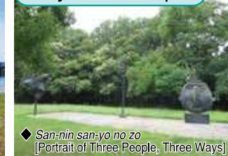
◆ San-nin san-yo no zo [Portrait of Three People, Three Ways]