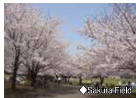
◆ Sakura Field

Opened April 1, 1978 Area 454,271.75 m 2 (4 Yashio, Shinagawa Ward 1 Tokai, Ota Ward) (Total area for Sports Forest and Nagisa Forest, including 50,273.75 m 2 of water) Facilities Track and field facilities. The class 3 certified track and field facilities with an 8 lane, 400 m track is suitable for holding all types of track events. Other facilities include changing rooms and photo finish equipment. Baseball fields: 6 diamonds (4 equipped with lighting for night games) Tennis courts: 12 hard courts (6 equipped with lighting for night games) Oi Sports Center: Conference rooms, changing rooms, shower rooms, and other facilities Seseragi Forest Field: Enjoy picnics and sunbathing. Parking: Area no. 1 – 190 spaces, Area no. 2 – 100 spaces (300 yen for the first hour, 100 yen/30 min thereafter) Shiosai Dog Run *For details on facility hours, please see the park's website or inquire by phone. Park closed: Dec 31 and Jan 1