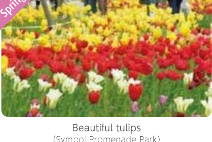
(Symbol Promenade Park)