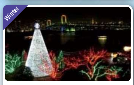
Christmas is coming (Odaiba Marine Park)