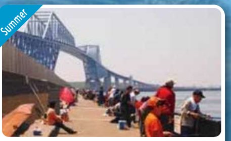
A perfect day for fishing (Wakasu Seaside Park)