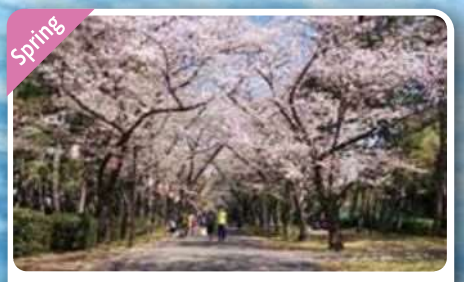
Cherry blossoms in full bloom (Tatsumi Greenway)