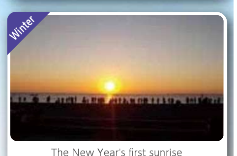
(Jonan jima Seaside Park)