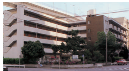
第三宿泊所(むつみ荘) The third lodging "Mutsumiso"