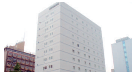
東京海員会館 "Tokyo kaiin kaikan"