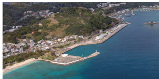
二見港 Port of Futami

The Ogasawara Islands were registered as the world natural heritage in June 2011.