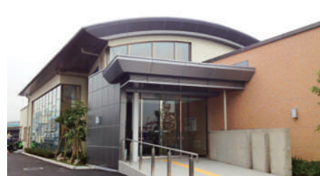
品川休憩所 "Shinagawa Resthouse"