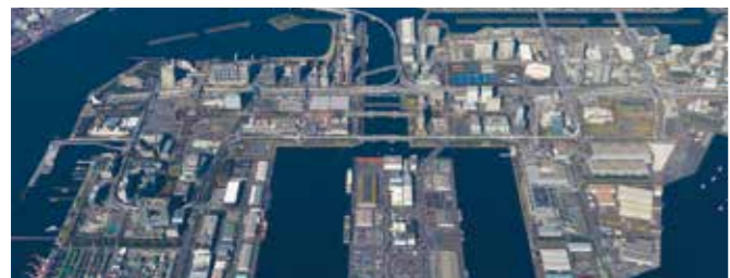
臨海副都心 Tokyo Waterfront City

Tokyo Waterfront City has embraced an urban planning concept of "strong against disasters" and has established necessary disaster prevention countermeasures.