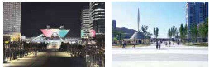
イーストプロムナード East Promenade セントラル広場 Central Plaza

臨海副都心ではゆとりある土地利用計画を推進しており、公園・緑地等の多くのオープンスペースは災害発生時には一時的な避難地、仮設住宅の建設場所、物資の集積地となります。