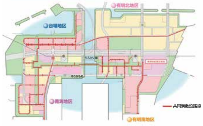
臨海副都心に整備された共同溝 Common ducts within Tokyo Waterfront City

The buildings and facilities within Tokyo Waterfront City were largely undamaged by the liquefaction brought on by the Great East Japan Earthquake of March 2011, which served to confirm the efficacy of the disaster prevention measures implemented thus far.