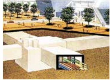
共同溝システムのイメージ図 Common duct system image diagram

また、上下水道・電気・ガス・情報通信・地域冷暖房用熱供給などを収容する共同溝が、地中壁の打設や地盤改良による液状化対策を行った上、道路、公園などの地下に整備されており、地震時のライフラインの安全性が確保されています。