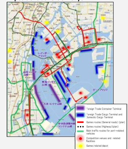
Map of facilities related to the Tokyo 2020 Games and Terminal positions at Port of Tokyo

Games-related cars will use same traffic routes as port-related vehicles.