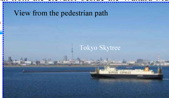
View from the pedestrian path

【Contact】 Port Road Management Division, Tokyo Port Management Office