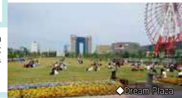
◆ Dream Plaza

New Transit Yurikamome: Get off at any station between Odaiba-kaihinkoen and Ariake Rinkai Line: Get off at Tokyo Teleport or Kokusai-Tenjijo Water bus: Get on at Hinode Pier (8 min. walk from JR Hamamatsu Station) and get off at Tokyo Big Sight