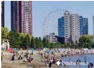
◆ Odaiba Beach