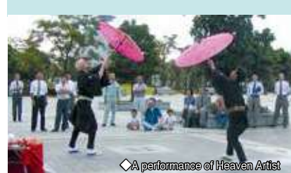
◆ A performance of Heaven Artist

A north-south promenade connecting Tokyo Big Sight and Ariake Tennis Park. The Stone and Light Square at its center is also registered as a venue for the Heaven Artist project.