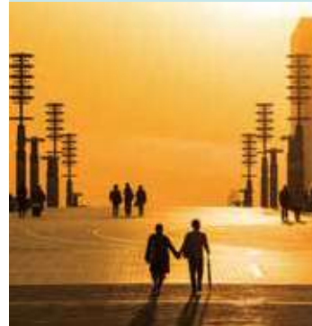
◆ Sunset in Tokyo Waterfront City seen from Yume-no-Ohashi Bridge.

An east-west promenade connecting the Central Plaza and Stone and Light Square. Tokyo Teleport Station Plaza is registered as a venue for the Heaven Artist project.