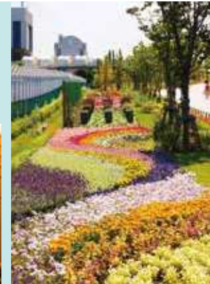
◆ Flowerbeds showcasing the colors of summer.

Dream Plaza is a 6,000 m 2 lawn stretching from Tokyo Teleport Station to Dream Bridge. (It's also a bustling new space in the Waterfront Subcenter!)