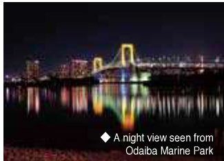
◆ A night view seen from Odaiba Marine Park