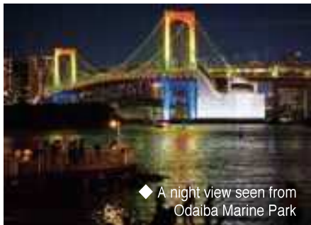
◆ A night view seen from Odaiba Marine Park