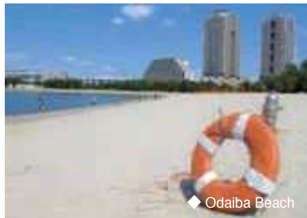
◆ Odaiba Beach