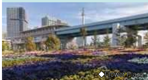
◆ Flower Plaza

A north-south promenade connecting Tokyo Big Sight and Ariake Tennis Park. The Stone and Light Square at its center is also registered as a venue for the Heaven Artist project.