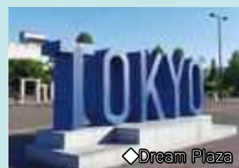
◆ Dream Plaza

A monument featuring the letters "TOKYO" stands in front of Tokyo Teleport Station to commemorate the holding of the Tokyo 2020 Games in the waterfront area.