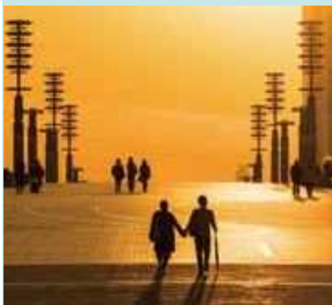
Sunset in Tokyo Waterfront City seen from Yume-no-Ohashi Bridge.

An east-west promenade connecting the Central Plaza and Stone and Light Square. Tokyo Teleport Station Plaza is registered as a venue for the Heaven Artist project.