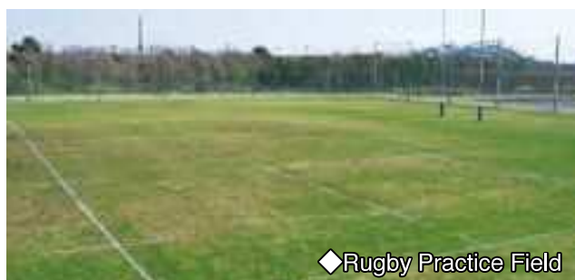
◆ Rugby Practice Field