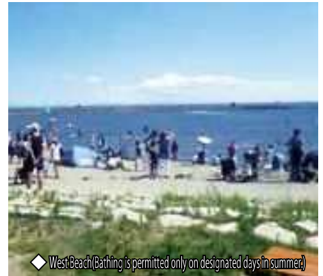
◆ West Beach (Bathing is permitted only on designated days in summer)

This park is a valuable example of the conservation of a vast natural wetland in a megacity, with human activities and rich nature coexisting in harmony.