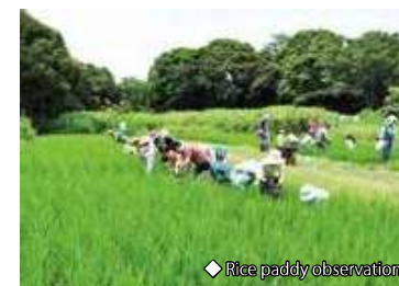
◆ Rice paddy observation

The East Asian-Australasian Flyway Partnership is an international project in which countries and NGOs from regions where the waterfowl of Japan and other nations migrate such as the U.S., Russia, China, South Korea, Southeast Asia, and Australia work together to promote the preservation of waterfowl and the wetlands which are their habitat. Tokyo Port Wild Bird Park, together with other areas such as Yatsu-higata, Osaka Nankou Bird Sanctuary, and the mouth of the Kuma River in Kumamoto Prefecture, participates in this partnership as an important habitat for sandpipers and plovers.