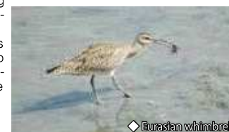
◆ Eurasian whimbrel

Access Monorail: Get off at Ryutsu Center/15 min. walk Keikyu Bus: Get on the Mori 24, 32, 36, 43, 45, 47 or bus at the East Exit of JR Omori Station or Keikyu Heiwajima Station and get off at Tokyo Port Wild Bird Park or Wild Bird Park.