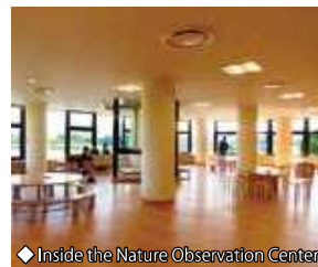
◆ Inside the Nature Observation Center