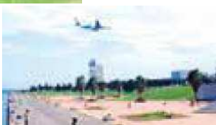
◆ Minato Field