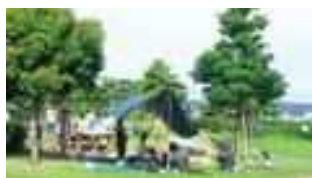
◆ Campground no.1