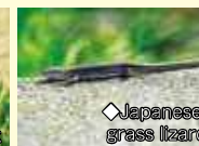
◊ Japanese grass lizard