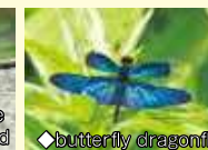
◊ butterfly dragonfly