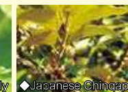
◊ Japanese Chingapin