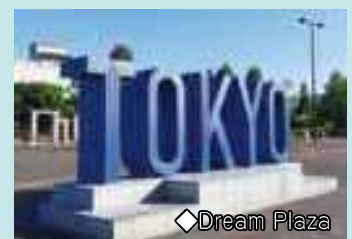
◆ Dream Plaza

A monument featuring the letters "TOKYO" stands in front of Tokyo Teleport Station to commemorate the holding of the Tokyo 2020 Games in the waterfront area.