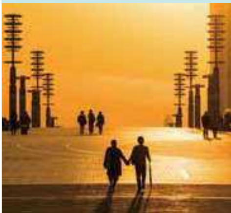
Sunset in Tokyo Waterfront City seen from Yume-no-Ohashi Bridge.

An east-west promenade connecting the Central Plaza and Stone and Light Square. Tokyo Teleport Station Plaza is registered as a venue for the Heaven Artist project.