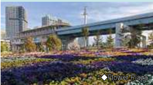
◆ Flower Plaza

A north-south promenade connecting Tokyo Big Sight and Ariake Tennis Park. The Stone and Light Square at its center is also registered as a venue for the Heaven Artist project.