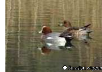
◆ Eurasian wigeon