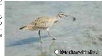
◆ Eurasian whimbrel

Binocular rental for bird watching is available free of charge. Please do not hesitate to request a pair.