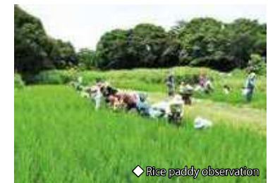
◆ Rice paddy observation

The East Asian-Australasian Flyway Partnership is an international project in which countries and NGOs from regions where the waterfowl of Japan and other nations migrate such as the U.S., Russia, China, South Korea, Southeast Asia, and Australia work together to promote the preservation of waterfowl and the wetlands which are their habitat. Tokyo Port Wild Bird Park, together with other areas such as Yatsu-higata, Osaka Nankou Bird Sanctuary, and the mouth of the Kuma River in Kumamoto Prefecture, participates in this partnership as an important habitat for sandpipers and plovers.