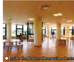
◆ Inside the Nature Observation Center

Monorail: Get off at Ryutsu Center/15 min. walk Keikyu Bus: Get on the Mori 24, 32, 36, 43, 45, 47 or bus at the East Exit of JR Omori Station or Keikyu Heiwajima Station and get off at Tokyo Port Wild Bird Park or Wild Bird Park.