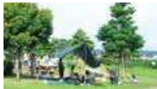
◆ Tsubasa Beach