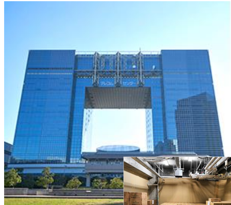
Telecom Center Bldg.