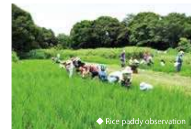
◆ Rice paddy observation

The East Asian-Australasian Flyway Partnership is an international project in which countries and NGOs from regions where the waterfowl of Japan and other nations migrate such as the U.S., Russia, China, South Korea, Southeast Asia, and Australia work together to promote the preservation of waterfowl and the wetlands which are their habitat. Tokyo Port Wild Bird Park, together with other areas such as Yatsu-higata, Osaka Nankou Bird Sanctuary, and the mouth of the Kuma River in Kumamoto Prefecture, participates in this partnership as an important habitat for sandpipers and plovers.