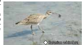
◆ Eurasian whimbrel

Monorail: Get off at Ryutsu Center/15 min. walk Keikyū Bus: Get on the Mori 24, 32, 36, 43, 45, 47 or bus at the East Exit of JR Omori Station or Keikyū Heiwajima Station and get off at Tokyo Port Wild Bird Park or Wild Bird Park.