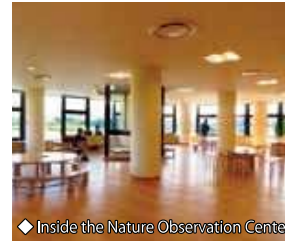
◆ Inside the Nature Observation Center