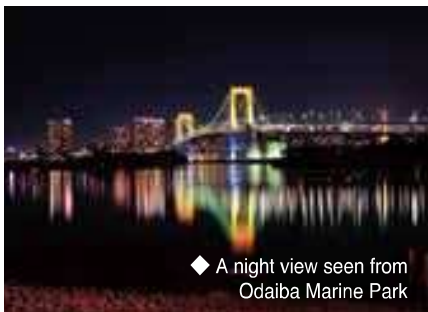
◆ A night view seen from Odaiba Marine Park

Bus: Get on the Umi 01 bus at Toei Subway/Tokyo Metro Monzen-Nakacho Station and get off at Odaiba-kaihinkoen Station or Daiba Station/4 min. walk