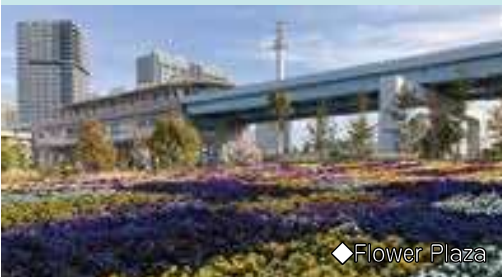
◆ Flower Plaza

A north-south promenade connecting Tokyo Big Sight and Ariake Tennis Park. The Stone and Light Square at its center is also registered as a venue for the Heaven Artist project.