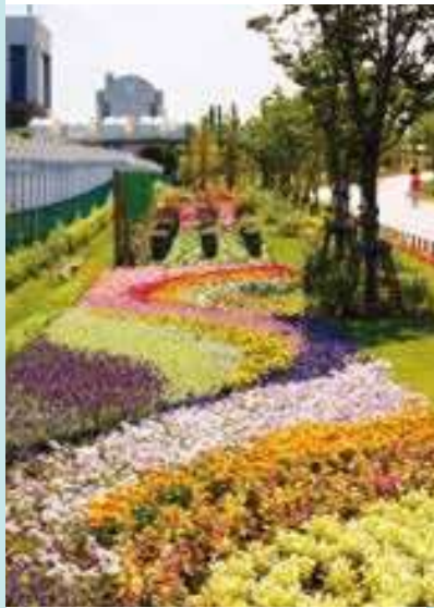
Flowerbeds showcasing the colors of summer.

Opened April 1, 1996 Area 264,446.73 m 2