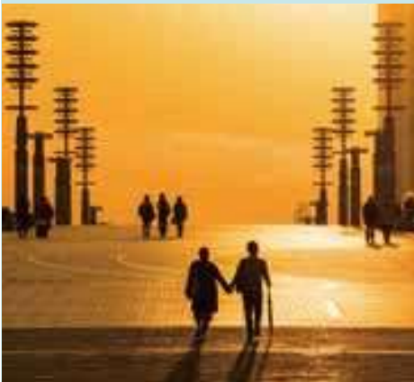
Sunset in Tokyo Waterfront City seen from Yume-no-Ohashi Bridge.

An east-west promenade connecting the Central Plaza and Stone and Light Square. Tokyo Teleport Station Plaza is registered as a venue for the Heaven Artist project.