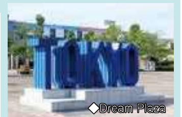
◆ Dream Plaza

A monument featuring the letters "TOKYO" stands in front of Tokyo Teleport Station to commemorate the holding of the Tokyo 2020 Games in the waterfront area.